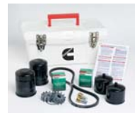
Cummins Onan Cruise Kit